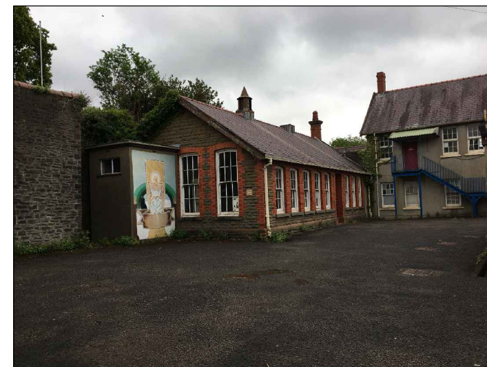
EXISTING FRONT VIEW